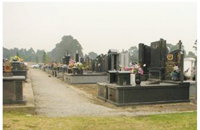
"Full Memorials" in which the caskets are buried under the granite monuments at Springvale Cemetery. Forest fires raging throughout Melbourne created smoky skies according to Kathy.