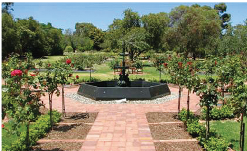
Roses are popular at most of the cemeteries. At Centennial Park there are 72 horticulturists on staff to care for the flowers and landscape.