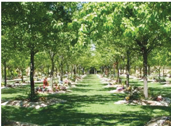
The Pavilion Garden in Enfield Memorial Park shows geometrically arranged casket graves with bronze plaques.

Springvale has rooms for catered receptions and rooms available for